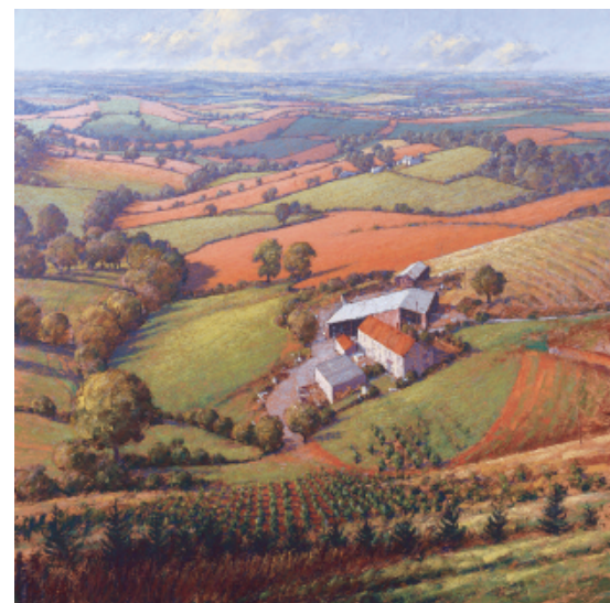
Above: Lionel Aggett. Devon Red Pastel 40.5x40.5in (103x103cm)